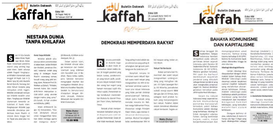
Figure 1: the Ideology of Kaffah